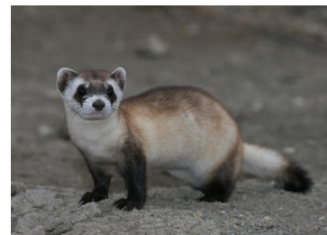
Black Footed Ferret