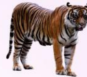
Sunda Island Tiger