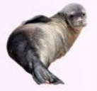
Hawaiian Monk Seal